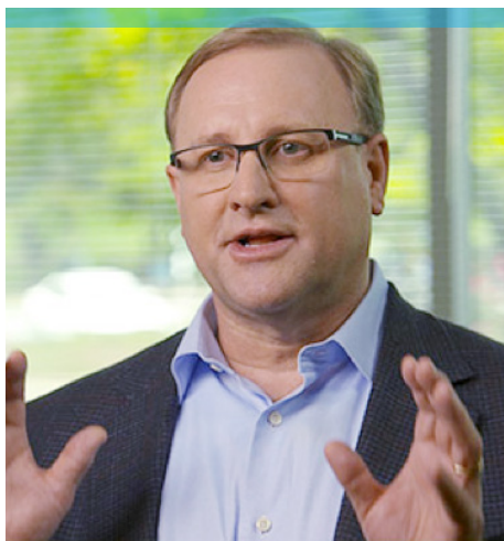
President and CEO, Agilent Technologies

Agilent teams are richly diverse in global cultural perspectives, individual knowledge and experience. However, what has always drawn us together across borders, business groups and individual jobs are our values, which includes always acting with uncompromising integrity. That will never change.